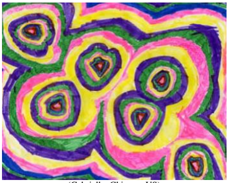
(Gabiella, Chicago, US)